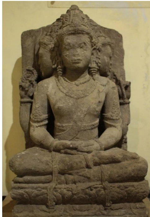
Figure 3 : Śiva Triśirah Statue Dieng in Dieng Kailasa Museum, Central Java

statue, there is also a smaller statue but a more fragile/weathered condition. The two front hands appear to be incomplete, and the front and rear of the left face are time-worn.