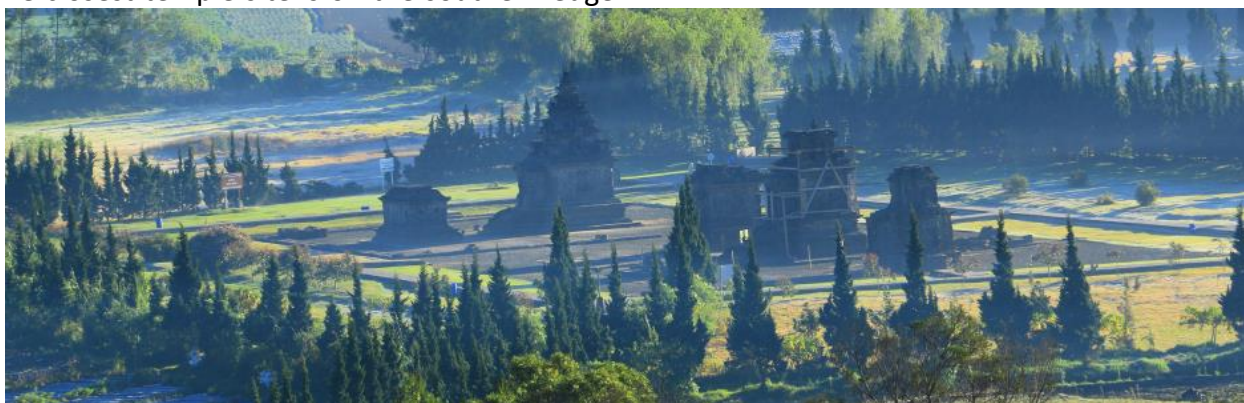
Figure 2: Arjuna Temple Complex

of the valley, the Ghatotkaca temple site, a temple that still exists accompanied by the remains of five other temples. At the northern edge of the valley is the Davaravati temple, again a single temple with the remains of three different temples. Finally, at the foot of the Highlands' southern side is the Bima Temple, which appears to be a single building. While each of the eight temples left in Dieng is the cella , small stones with a single interior space represent various approaches to building type and altar of worship.