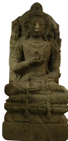
Figure 8: Statue of Viṣṇu – Śakti and Hari Hara

Another statue is the statue of Hari Hara (Figure 8). This statue depicts Śiva and Viṣṇu in one character. This statue is worshipped by Hindus who worship Śiva ( Śivaistik ), as well as Viṣṇu worshippers, known as Vaiṣṇava . Various literary sources and inscriptions tell several names of these types of images, such as Hari-Sankara , Śiva-Kesava , Sankara-Narayana , Murariswara-Ardhasauriswara . The Śiva-Viṣṇu statue found in Dieng is known as Hari-Hara .