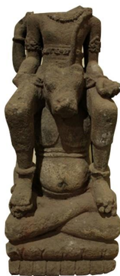
Figure 4: Statue of Nandisavahanamūrti

This statue seemed to leave a message that a devotee must diligently meditate by holding Śiva , his idol god, on his shoulders. The whole body supports Śiva . Theologically, it can be interpreted that in meditation for a worshiper, the Revered God is not far away but is upheld on the shoulders in the form of divine awareness. This interpretation is what distinguishes the typology of Hindu theology from other religions. Hindus consider God very close. Even the spirit entity must be His servant by upholding Thee.