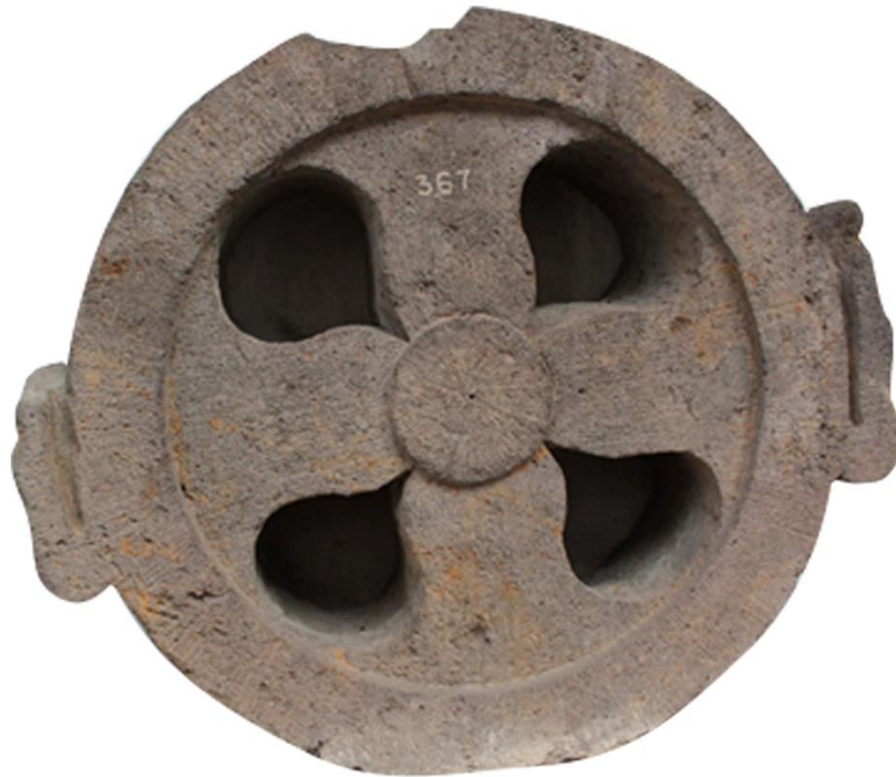
Figure 10: The Wheel of Dharma Statue