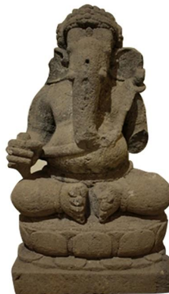
Figure 7: Statue of Ganesha