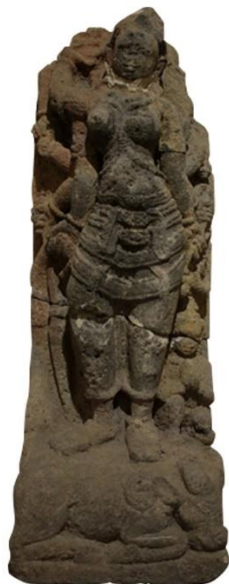
Figure 6: Statue of Durgā Mahiṣāsura-mardhinī

replace the elephant head, Batara Gana also changed its name to Batara Mahadewa . It is said that because Umayi Devi turned into Batara Durga , Batara Guru then married Parwati Devi , and from that marriage, Ganesha was born.