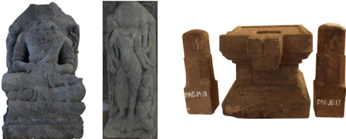
Figure 5: Statue of Śiva Mahadeva, Parvati, and Liṅga

In the Dieng Plateau, as the oldest holy point on the island of Java, also found worship media in the form of liṅga . Liṅga is the medium of worship of Śiva, also known as Śivaliṅga , a significant symbol, which is usually complemented by yonī . Another unique thing is the discovery of a medium-sized Śiva-Parvati statue. This statue is impressive because it is very rarely found in Indonesia, Śiva-Parvati in one stone statue. Śiva-Parvati is in a standing position, with some parts, especially the face, in a damaged condition.