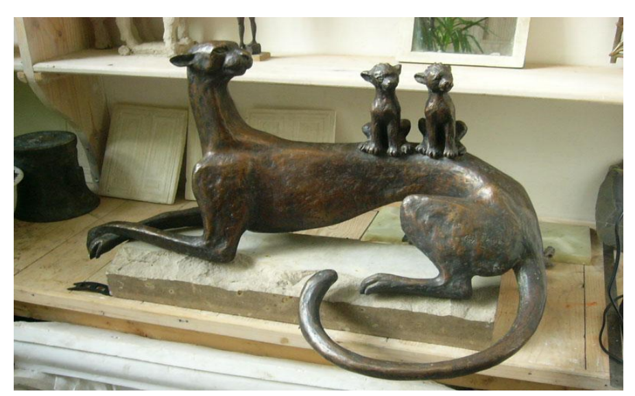
Figure 4: M. Ostrovskaya. Cheetah, Bronze, 1990s

leave to our generations! There will be less and less people close to nature and seeking for true inspiration consolation in it; indeed, many material "benefits" acquired by humanity cannot repair losses inflicted on the world by these acquisitions, since it is not souls but rather stomachs that acquire(Vorobyev's letter to V.A. Vatagin, 1959-1960: 103).