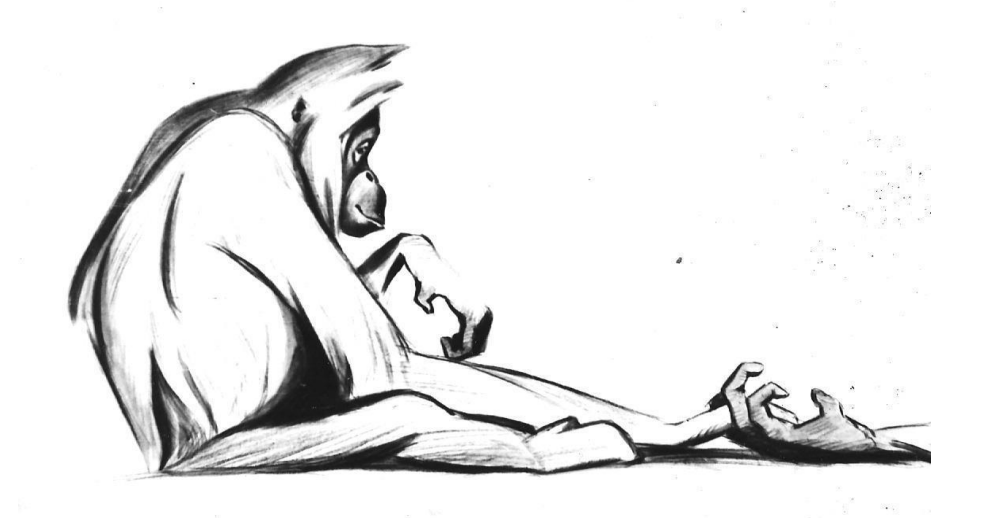
Figure 2: V.Vatagin. Handshake. 1926. Pencil.