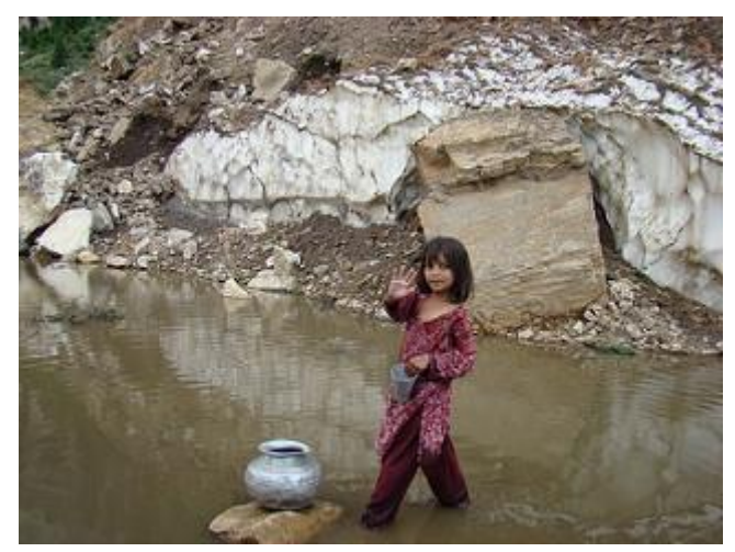
Figure 2: A Little Girl about to Fetch Water

Reid, K. (2018, May 17). Global water crisis: Facts, FAQs, and how to help, retrieved on 30 May 2018 from, https://www.worldvision.org/dean-water-news-stories/global-water-crisis-facts