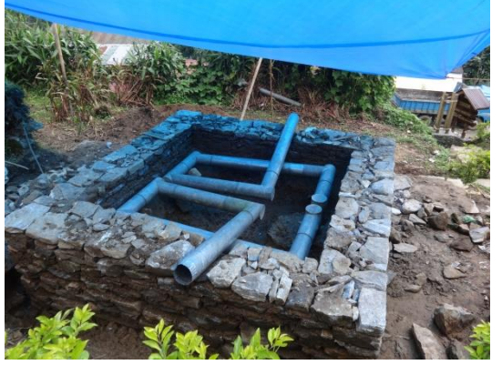
Figure 3: ' Bhatti ' using flue-pipe; Source: Field Survey