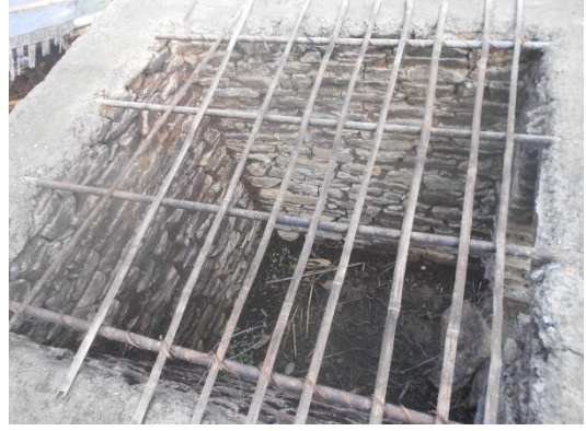
Figure 2: ' Bhatti ' using firewood in Darap

Though Tata Energy Research Institute (TERI), has developed 'Gasifier system of curing chamber' which is fuel efficient, low cost and fast curing (Subba, 2014), still it has not been introduced in the selected study areas.