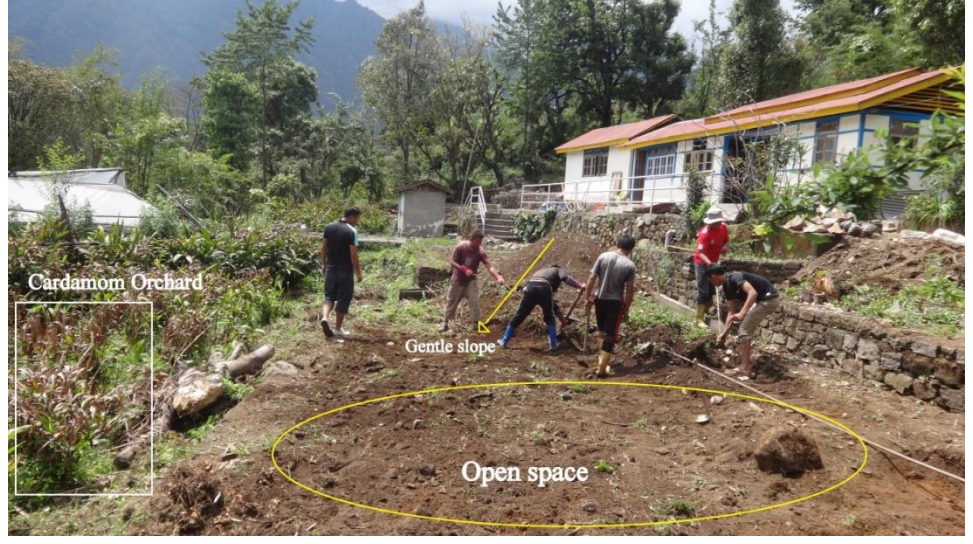
Figure 1: Primary Nursery Bed Preparation at Yuksam.

Capsules curing is an age-old practice in Sikkim where seeds are exposed on fire, but excessive fire and smoke causes poor quality and dry product (Kishore and Rastogi, 1987). It takes 35-40 hours for drying of capsules, but due to higher exposer on fire, it causes 350-550 kg moisture evaporated leading to decrease in the aroma. It also leads to 4-9 kg fuelwood consumption for per kg drying of cardamom along with 15-25 kg/hour fuel burning rate (Mande et al., 1999). Presently, the traditional system of Bhatti (Figure 2) has been changed to modern