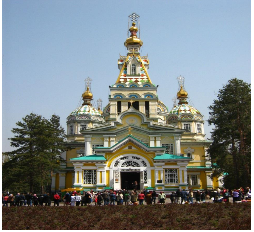
Figure 3: The Ascension Cathedral in Almaty