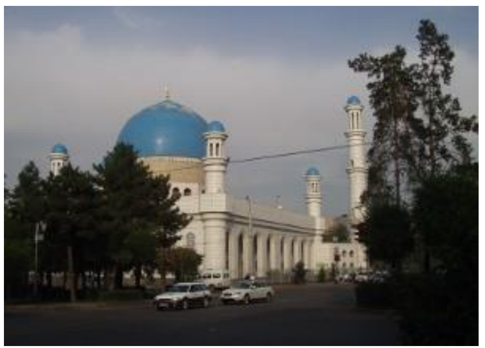
Figure 1: The Central Mosque in Almaty

According to the data of the Committee for Religious Affairs of the Ministry of Justice of the