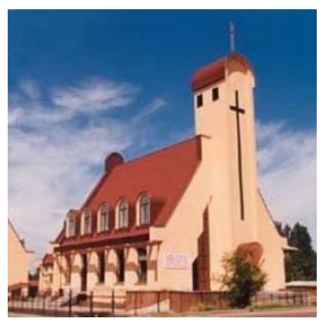
Figure 4: The Roman-Catholic Church of the Holy Trinity in Almaty

The Roman Catholic Church (RCC) (see, Figure 4) too makes a positive contribution to the preservation of religious tolerance among the believers. In 1991, Pope John Paul II established the Apostolic Administration in Kazakhstan and Central Asia.