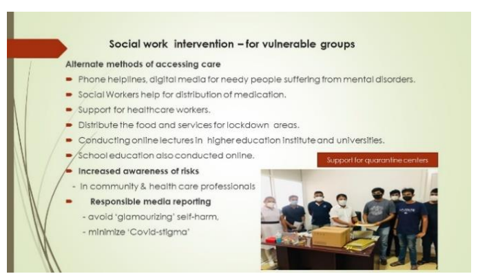
Figure 5: The NISD School of Social Work Students

Sri Lanka has been ranked 9th best country globally for its successful immediate response to tackling the virus.