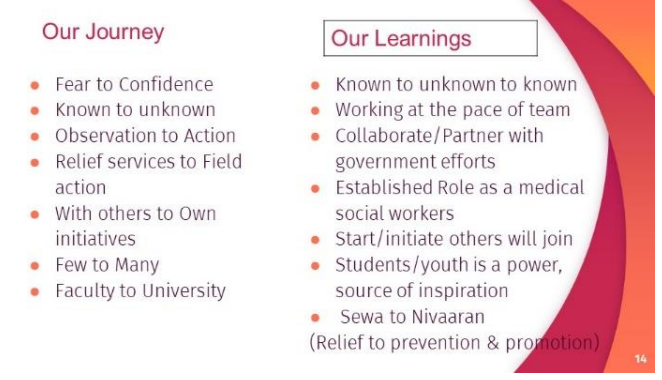
Figure 1: Pandemic learnings in Social Work at MS University, Baroda Source: Authors

preventative methods through door-to-door campaigns. Regular fieldwork engagements with various social services were suspended, and the entire efforts of students and staff were directed into COVID-19 utilising opportunities that came up from the government and the hospitals. Figure 1 illustrates the multiple lessons learned by the students and the faculty.