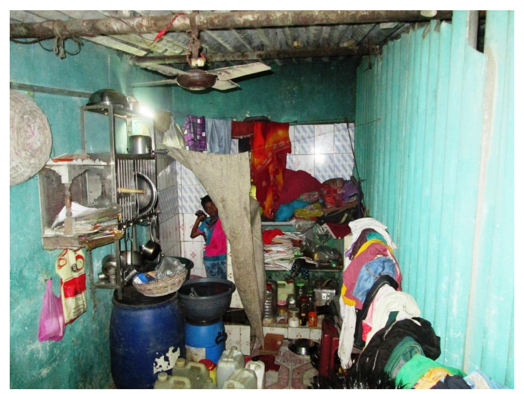
Figure 4: The inside of a regular house in a basti . This was taken in Kalyan, Thane District, Maharashtra, 2014.