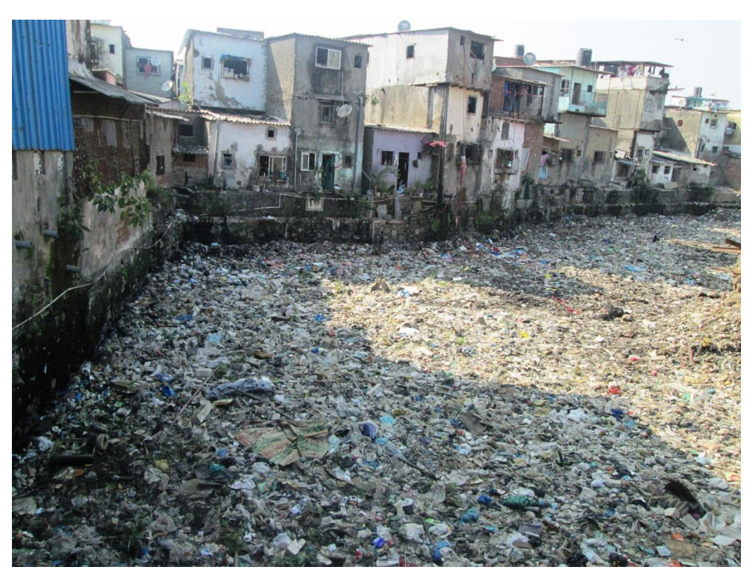
Figure 6: Houses on the banks of a large drain. This was taken in Mumbai, 2014, as part of a drive by girls to document problems of garbage and sanitation issues in their area.