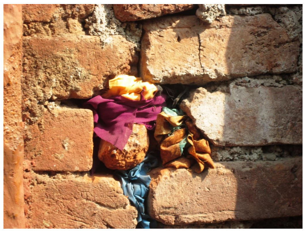
Figure 3: Cloth rags used during menstruation stored by stuffing them in a brick wall. This was taken in Kalyan, Thane District, Maharashtra, 2013, as part of a project where girls were documenting their experiences of menstruation.