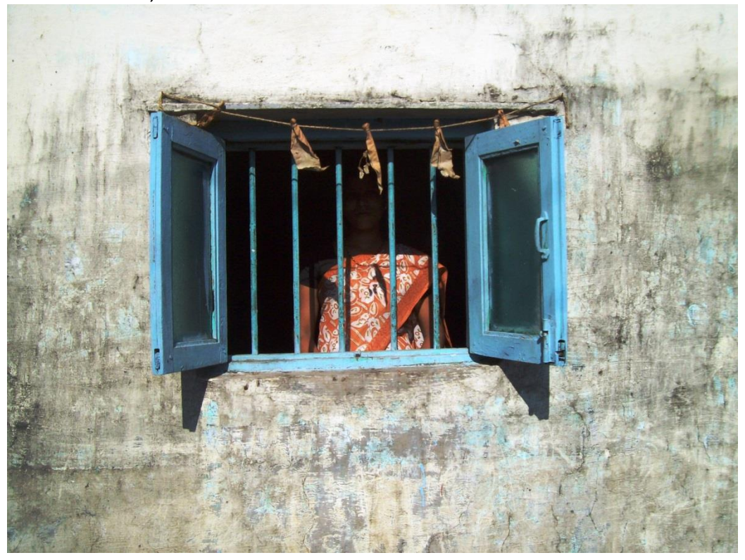
Figure 1: Woman looking through her window. This photograph was taken in Ambernath, Thane District, Maharashtra, 2011.

was with a trust in Mumbai that conducts educational and other activities for children. Different kinds of audiences were reached out to at these four exhibitions, with varied themes covered.