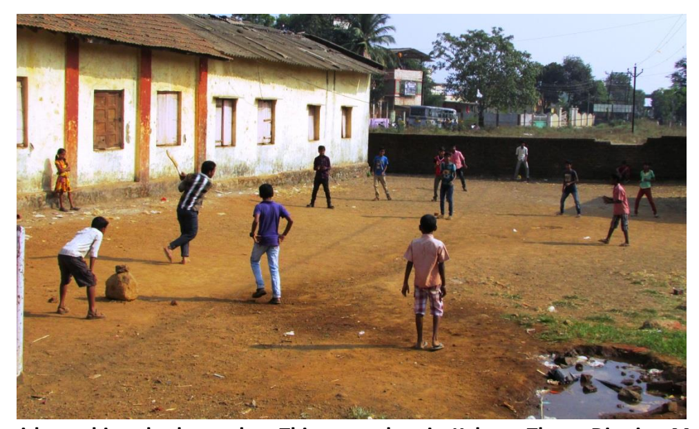
Figure 2: A girl watching the boys play. This was taken in Kalyan, Thane District, Maharashtra, 2013.